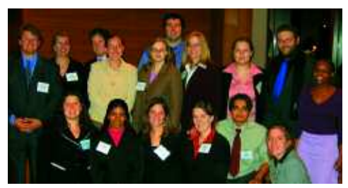
Model United Nations Team