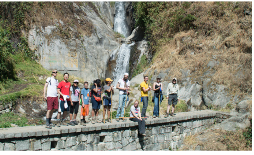
The ISU team at the Palakala Waterfall in the peasant community of Huaquicha.

"Peru is going to be your classroom and Peruvians are going to be your teachers. Everything you see, everything you hear, everywhere you go is a lesson. So we need to keep our eyes open, our ears open, and use all of our senses to absorb all of the experience."