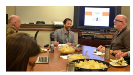
Yusuf Sarfati engaging with faculty

Professor Kerri Milita presented "Beyond Rolloff: Individual Level Determinants of Abstention Behavior" at the department's brown bag seminar Sept. 17. The project examined why individuals who turn out to vote on Election Day often fail to complete their ballot. In particular, the study explores the role of several key psychological factors that lead individuals to not cast a vote for particular ballot items. Findings from two survey experiments suggest there are three critical traits that make individuals particularly prone to abstention behavior: low political